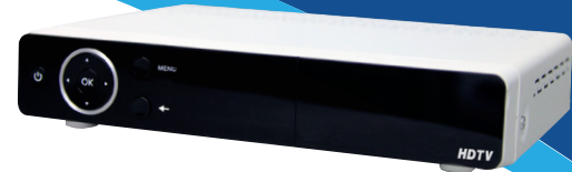
VMX1-1 (front view)

Part of ATX's all-digital CONDOR solution, the VMX1-1 HD QAM set-top box descrambles signals from the CONDOR headend while converting digital signals to analog for display on legacy TVs. The unit is equipped with a single tuner for the recording of one TV channel & features Verimatrix® CAS for content protection. Offering HDMI™ & composite outputs, the unit provides PVR/media player capabilities, Electronic Program Guide (EPG) support & an intuitive high-definition interface for ease of use. The VMX1-1 can be deployed as a standalone solution for non-encrypted clear QAM applications.