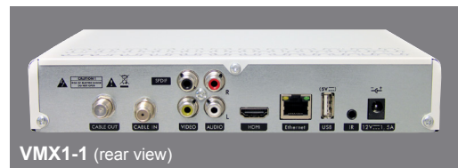
VMX1-1 (rear view)