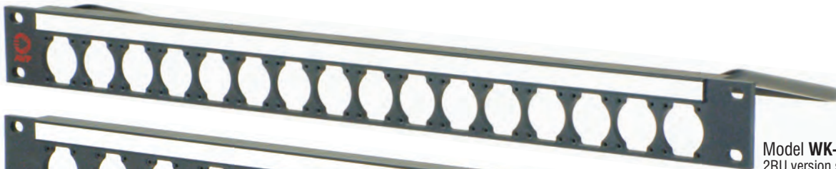
Model WK-U116E1-Z 2RU version shown above